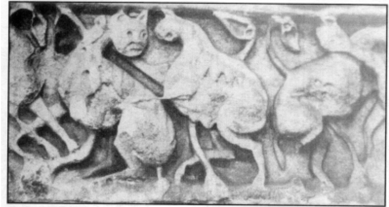
Figure 11.3 A most graphic portrayal from Saxon times of an attack on a herd of long-necked quadrupeds by a bipedal predator. Note the predator's two large legs and puny forelimbs. This portrayal conforms very closely indeed to the description of Grendel, and is a clear indication that such creatures were to be seen on the British mainland as well as the Continent, as is also shown by Athelstan's and other charters. The stone can be seen inside the church of SS. Mary and Hardulph at Breedon-on-the-Hill in Leicestershire.

Here we are presented with a truly remarkable scene. The stone in which these strange animals are carved, is preserved in the church of SS. Mary and Hardulph at Breedon-on-the-Hill in Leicestershire. This church used to belong to the Saxon kingdom of Mercia. The stone itself is part of a larger frieze in which are depicted various birds and humans, all of them readily recognisable. But what are these strange creatures represented here? They are like nothing that survives today in England, yet they are depicted as vividly as the other creatures. There are long-necked