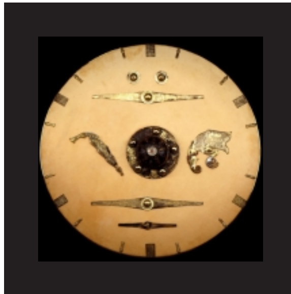
Shield from the ship-burial at Sutton Hoo (part-reconstruction) Anglo-Saxon, early 7th century AD From Mound 1, Sutton Hoo, Suffolk, England