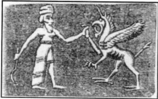
Fig. 11.2 Was Beowulf's method of mortally wounding Grendel entirely novel, or was he merely employing a tried and tested strategy? This illustration from an early Babylonian cylinder seal, and it portrays a man seizing and about to amputate the forelimb of a Grendel-like bipedal monster.

But is Beowulf's method of slaying Grendel unknown elsewhere in the historical record? Are there no depictions to be found of similar creatures being killed in a similar way? It would seem that there are, the illustration below being one example (see Figure 11.2). It is taken from an impression of an early Babylonian cylinder seal now in the British Museum, and clearly shows a man about to amputate the forelimb of a bipedal monster whose appearance, though stylistic, fits the descriptions of Grendel very closely. I know of no scholar who would venture to suggest that the Old English author of Beowulf filched his idea from his knowledge of Babylonian cylinder seals. So we may, I think, safely assume that Beowulf's method of slaying this particular kind of animal was not entirely unknown in the ancient world. Nor, indeed, was the Grendel itself entirely unknown in the ancient world, as is evident from the following item depicted in Figure 11.3.