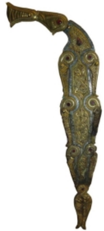
Fig. 11.1 The portrayal from a Saxon shield (Sutton Hoo burial site) of a flying reptile at rest. Note the wings folded along its sides as well as the long tooth-filled jaws. Comparison of this with a modern reconstruction of a Pterodactyl or similar creature is most instructive.

To the hapless Danes who were the victims of his predatory raids, however, Grendel was not just an animal. To them he was demon-like, one who was synnum beswenced (afflicted with sins). He was godes ansaca (God's adversary), the synscatha (evil-doer) who was wonsaeli (damned), a very feond on helle (devil in hell)! He was one of the grundwyrgen , accursed and murderous monsters who were said by the Danes